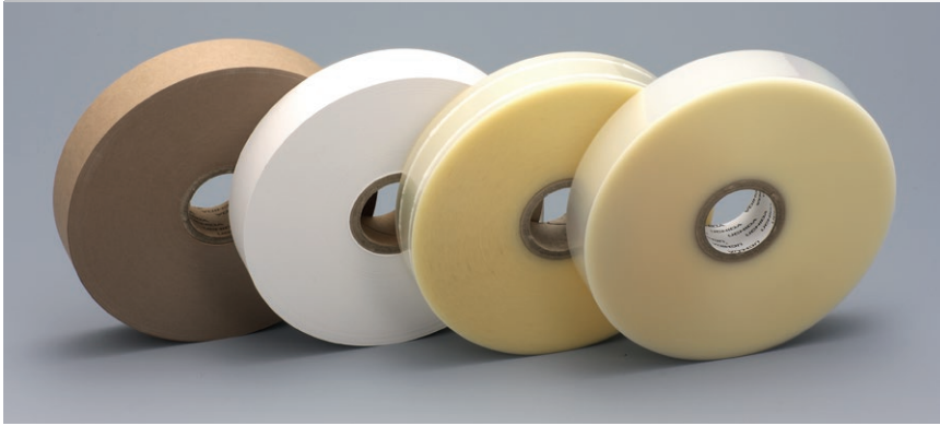
Kraft paper tape White paper tape Magic-cut tape Transparent film tape