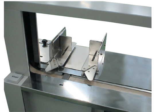
Auxiliary guide for soft materials helps bundling such as envelopes, letter papers etc. (For Tapit-WX, WII+)