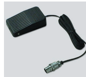
Foot switch for all models.