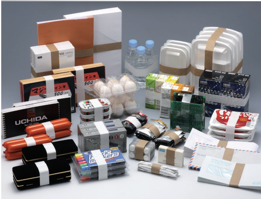
Bundling optimize your workflow in graphic, food, packaging, logistics, pharmaceutical and more industries.