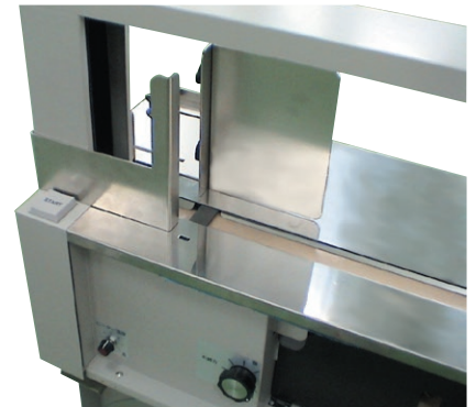
Auxiliary guide for small materials is a great solution for bundling business cards, tags, labels etc. (For Tapit-WX, WII+)