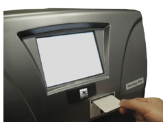
Touch screen interface