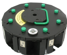
Key Locked Carousel & Trays